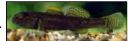
Crans bully Gobiomorphus basalis