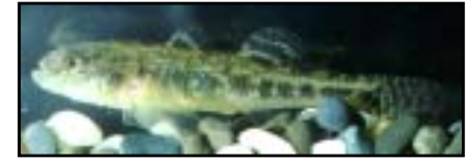
Tarndale bully Gobiomorphus alpinus