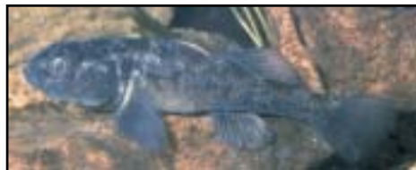
Common bully Gobiomorphus cotidianus