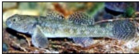
Upland bully Gobiomorphus breviceps