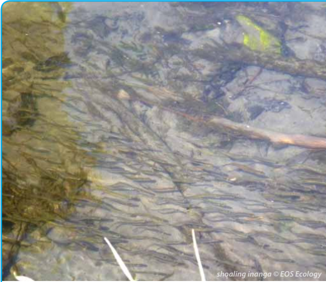
shoaling inanga

He māmā te tautuhi i ngā inanga pakeke mai i ētahi atu momo ika i te mea he iti noa ka noho i ngā wāhi ōrite, he ōrite rānei te noho.