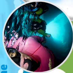
Experiencing Marine Reserves