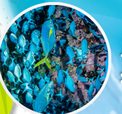
Marine Protected Areas