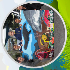
Community Led & Kaitiaki Actions