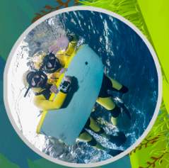
Snorkelling Te Kura Moana