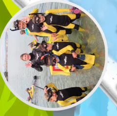
Community Snorkel Days