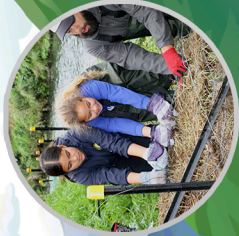
Whitebait Habitat Restoration