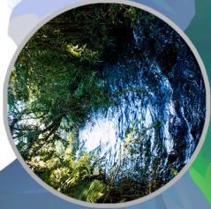
Freshwater Protected Areas